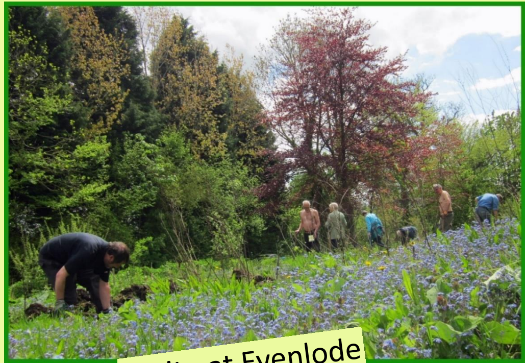
A site at Evenlode

meet on Wednesday mornings from 10 to 1 throughout the year.