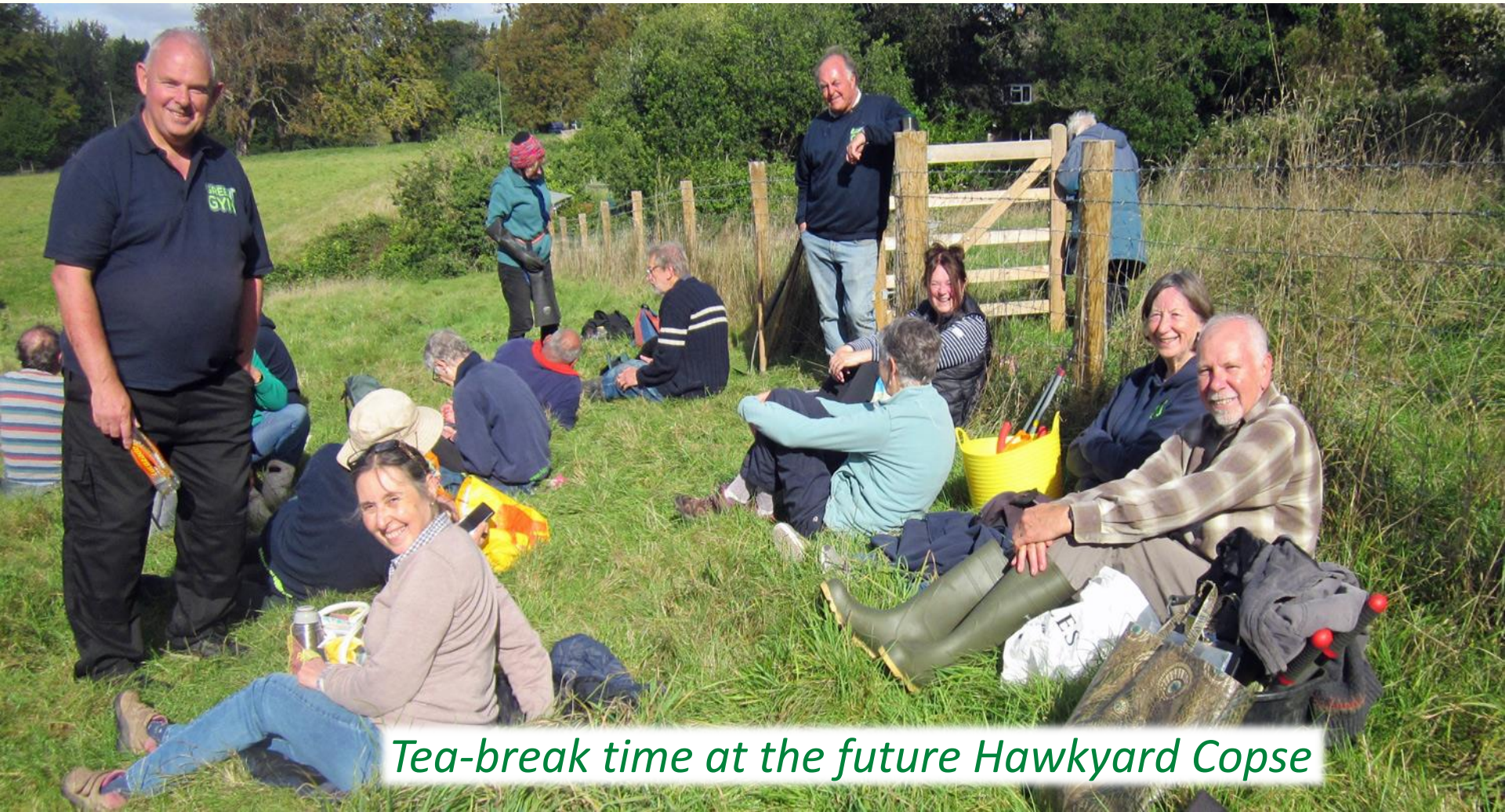
Tea-break time at the future Hawkyard Copse

Interested in joining the team and giving it a try? Then email us via www.chippygreengym.org You'll get a warm welcome – rain or shine!